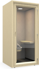
Glazed front, Upholstered back PWP-GPB