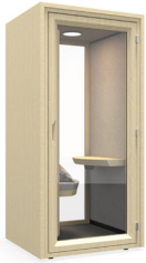
Glazed front & back PWP-GGB